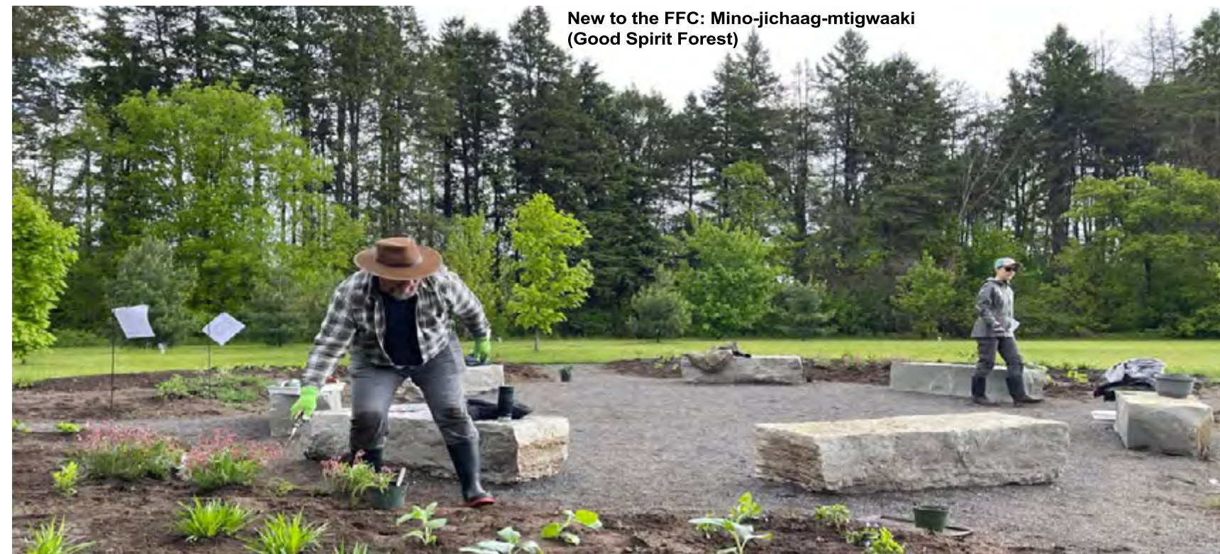
New to the FFC: Mino-jichaag-mtigwaaki (Good Spirit Forest)